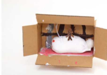
Dinah Grey [bunny's tail]