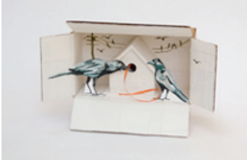
Alan Disparte [childhood farm]

3579 17th Street (at Dolores) San Francisco, CA 94110